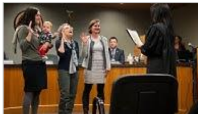
New City Councilors and Mayor